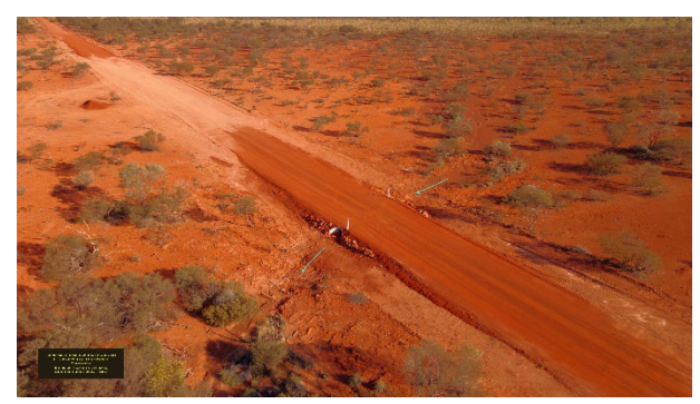
Caption: Tjirrkali Road, works complete.

Whilst this project stopped at the road subgrade level, it has provided a sound base to undertake gravel re-sheeting upgrades in the future. This work will then see better road resilience for heavier vehicles without damaging the road and as a result, will increase the life of the road, reduce maintenance costs, and enhance the Shire's sustainability.