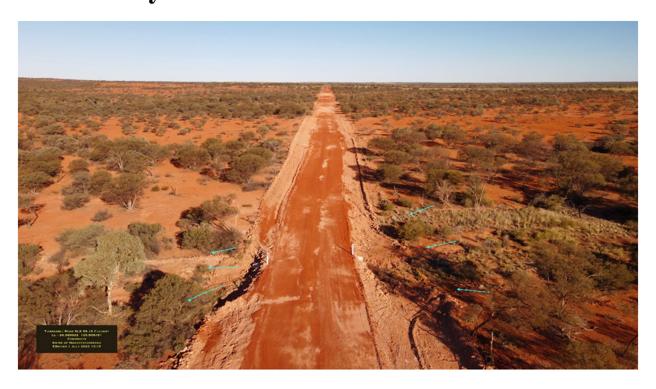
Caption: Tjirrkarli Road, aerial view of completed works

The residents of the remote community of Tjirrkarli can enjoy improved, safer, and more reliable access to the remote community with the recent completion of upgrade works to Tjirrkarli Road.