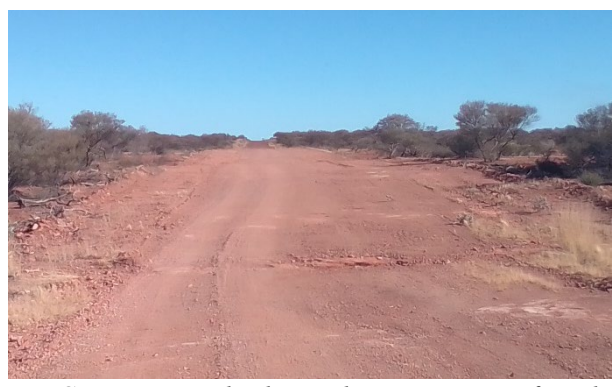
Caption: Tjirrkarli Road prior to start of works

Furthermore, these crests and gullies also created a very rough and unsafe driving experience for motorists.