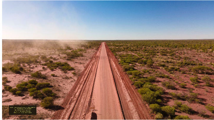
Caption: Great Central Road showing widened formation

To boost road safety for the communities and travellers, the road formation was first widened to provide an appropriate foundation for the improvements.