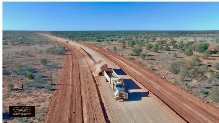
Caption: Great Central Road, tipping of select gravel

Selected gravels were added to strengthen the pavement and make it more durable to traffic.