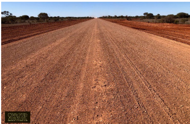
Caption: Great Central Road, works complete.

Completion of the works has resulted in a road that is more comfortable to drive and better able to handle everyday traffic.