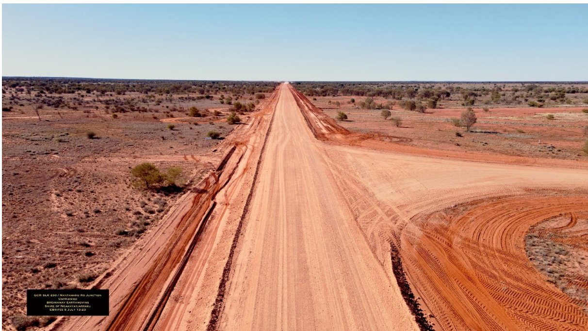
Caption: Great Central Road, aerial view of completed works

The residents of the remote communities throughout the Ngaanyatjarra Lands, service providers and tourists can enjoy improved, safer access to their destination with the recent completion of further upgrade works to Great Central Road between SLK 229.00 and SLK 243.10.