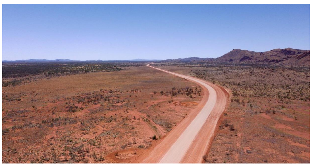
Caption: Indigenous Land Use Agreement to be formalised, enabling Shire to manage and maintain local roads.

The Shire of Ngaanyatjarraku has finalised an Indigenous Land Use Agreement with three Aboriginal corporations for existing roads within an agreed area of land within the Shire's boundaries. This agreement provides the Shire with a legal agreement to manage the roads, including maintenance and renewal, and be eligible for ongoing government grants to fund road works and maintenance.